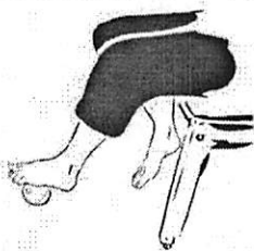
Figure 7: Rolling plantar fascia stretch

The rolling stretch (Figure 7) is another simple way to stretch the plantar fascia. To perform this exercise, sit on the edge of a bed and place your foot on a hard cylindrical object such as a plastic water bottle or a ball. Roll the foot over the object while maintaining pressure against it. Continue rolling for 30 - 60 seconds, stop, and then repeat for a total of 5 times. This stretch should be performed 3 times per day. For pain relief while performing the exercise, use a water bottle filled with cold water or chill the ball in the refrigerator prior to performing the exercise.