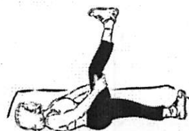
Figure 5: Hamstring stretch

The hamstring is a major muscle of the thigh that runs from just below the knee to the buttocks and lifts the lower leg and bends the knee. If the hamstring is too tight, the bend in the knee