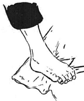
Figure 8: Towel curls

Lay a hand towel on an uncarpeted floor and place the bare foot on the towel (Figure 8). Keeping the heel on the floor, curl the toes, pulling the towel toward you. Continue pulling the towel with the toes until it is bunched under the arch of the foot. Repeat this procedure 10 times with each foot. As your feet get stronger, resistance