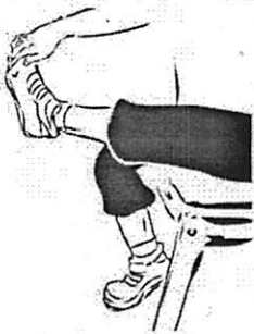
Figure 6: Seated plantar fascia stretch

During normal walking, the plantar fascia lengthens and then shortens as the foot lands. If the plantar fascia is insufficiently elastic repetitive lengthening and shortening can result in damage to the fibers of the fascia with subsequent inflammation. Exercises that stretch the plantar fascia can improve its flexibility and help it withstand the stresses that are placed on it without damage.