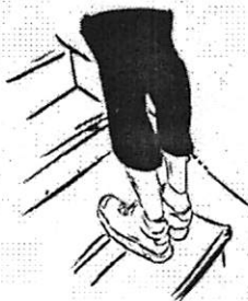
Figure 3: Stair stretch

The gastrocnemius can also be stretched using a simple exercise that can be performed while standing on a stair (Figure 3). Stand with the ball of the foot on the edge of a stair and heels off the step. While holding the banister for